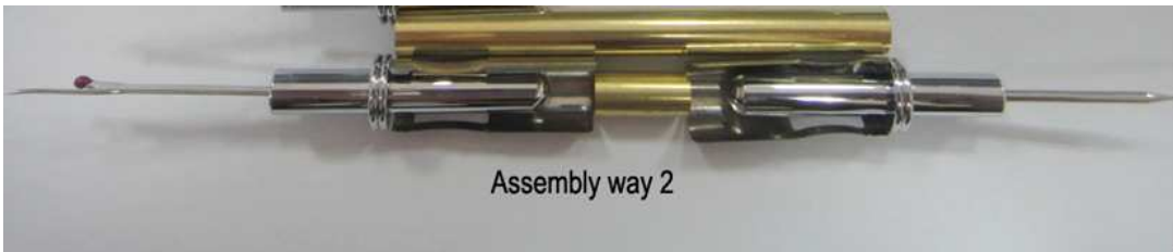
Assembly way 2