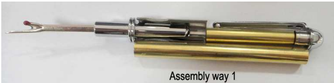
Assembly way 1