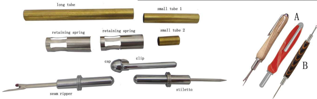
DiagramA parts list