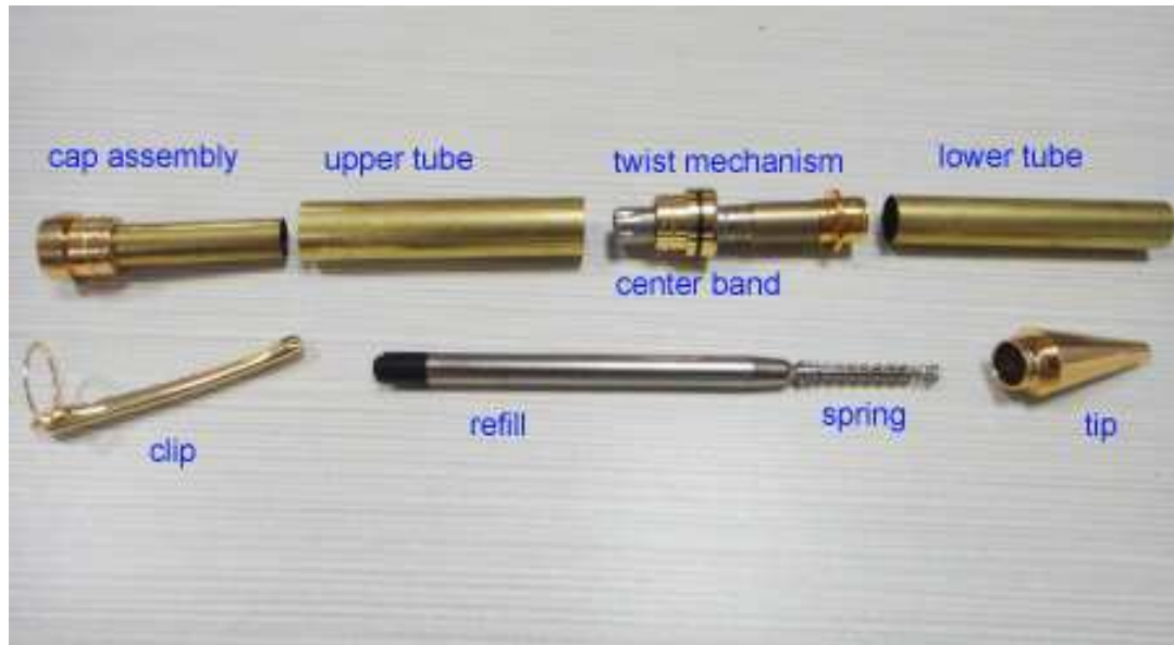
DIAGRAM A -- Assembly