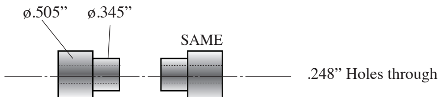
Diagram C / Bushings #9568